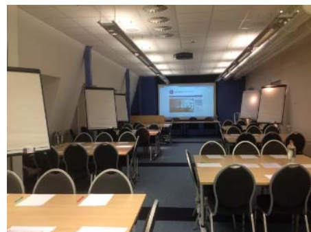
The UEMS House - Domus Medica Europaea (left photo) located in the Rue de l'Industrie 24, 1040 Brussels - BELGIUM Tel: +32 (0)2 649 51 64 and Fax: +32 (0)2 640 37 30 Offices and one of the meeting rooms (photos above)